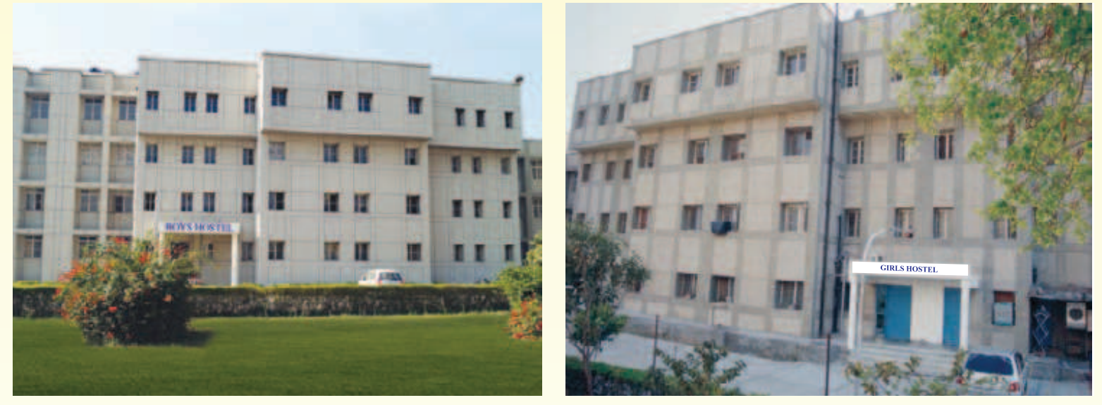
RAM-EESH BOYS HOSTEL

Hostel facility is available both for boys and girls. The rooms are spacious, airy and well furnished. Excellent hygienic conditions are ensured through regular maintenance and cleanliness. Students have enough freedom to live independently but each one of them is required to follow a code of conduct so that all live like a 'joint family' and have a strong 'we' feeling. Full time watch and ward facility has also been provided by wardens residing in the campus to check any untoward incident and provide immediate help. In addition, there is 24 hours security available.